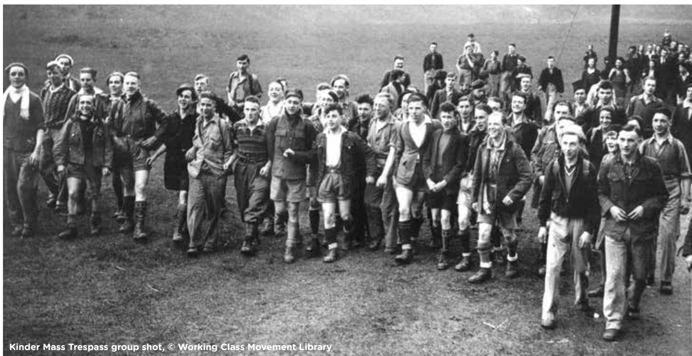
Kinder Mass Trespass group shot