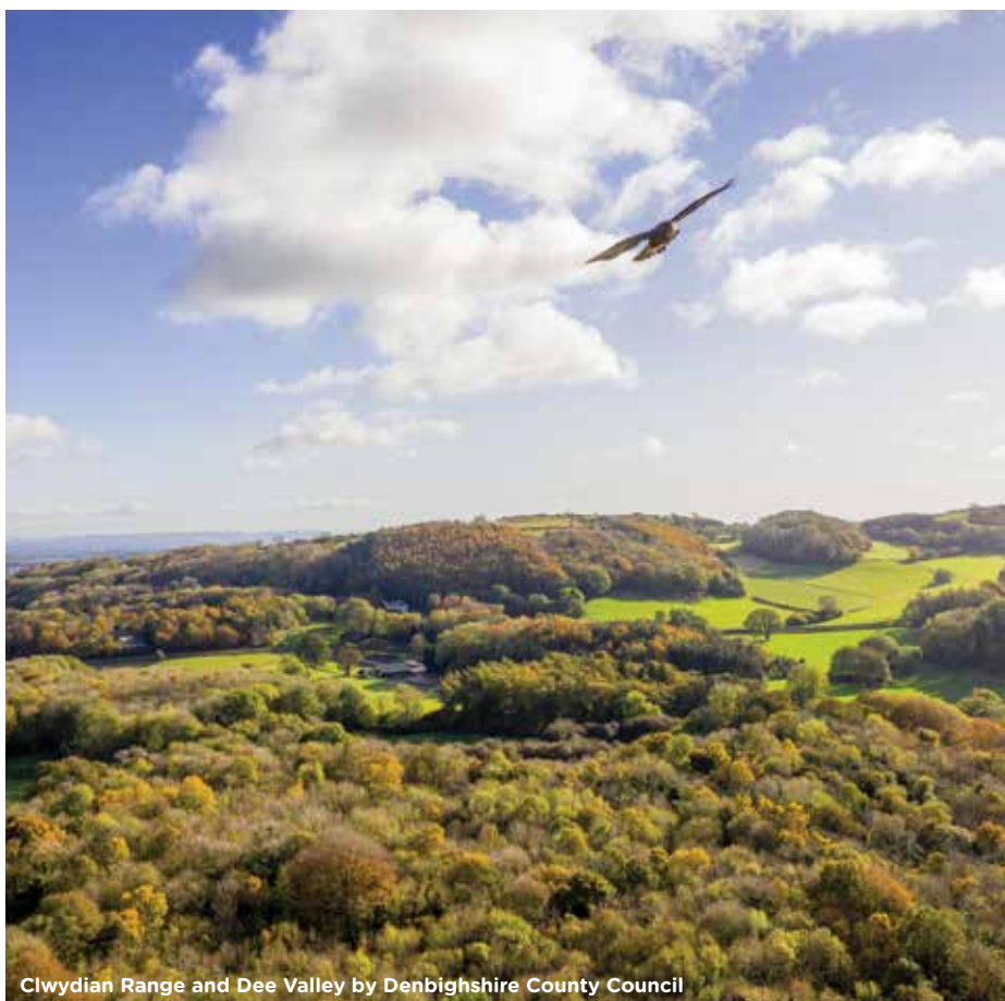
Clwydian Range and Dee Valley by Denbighshire County Council