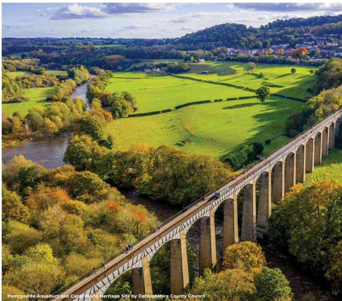
Pontcysyllte Aqueduct and Canal World Heritage Site by Denbighshire County Council