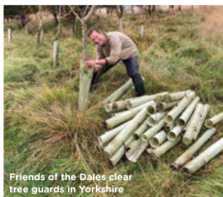
Friends of the Dales clear tree guards in Yorkshire

adapting to, and mitigating climate change. There are huge efforts underway to do both and it's clear that tree planting has a role to play in this, but the benefits - carbon capture, habitat creation etc. - are undermined when each sapling is surrounded by a new, single-use plastic tree guard."