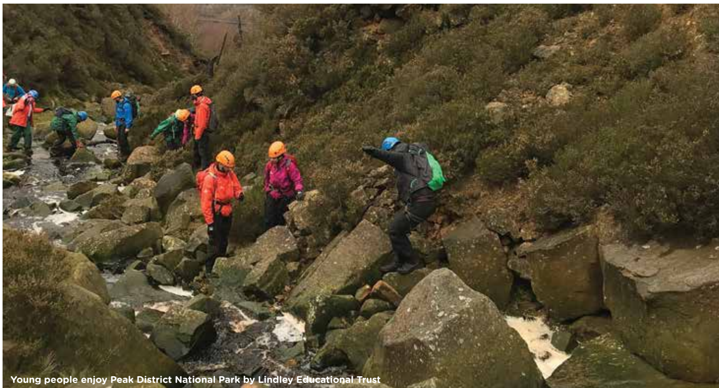
Young people enjoy Peak District National Park by Lindley Educational Trust