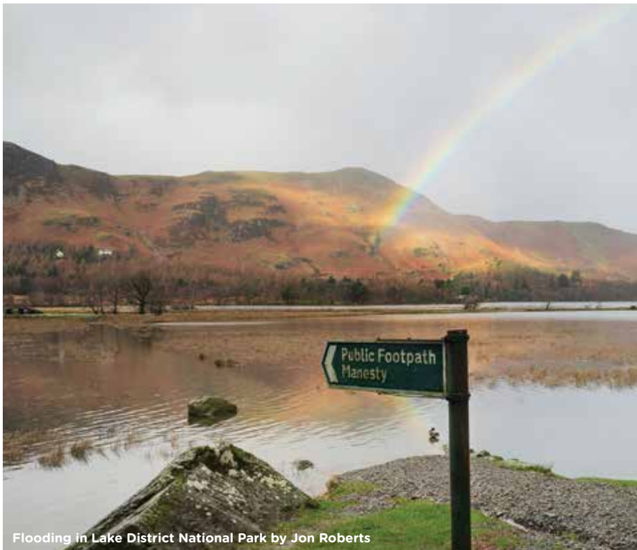
Flooding in Lake District National Park

members appointed on the basis of their expertise. This should include both an increase in the proportion of national members and the introduction of merit-based criteria for local authority appointments.