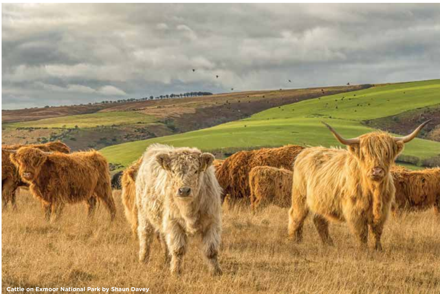
Cattle on Exmoor National Park by Shaun Davey