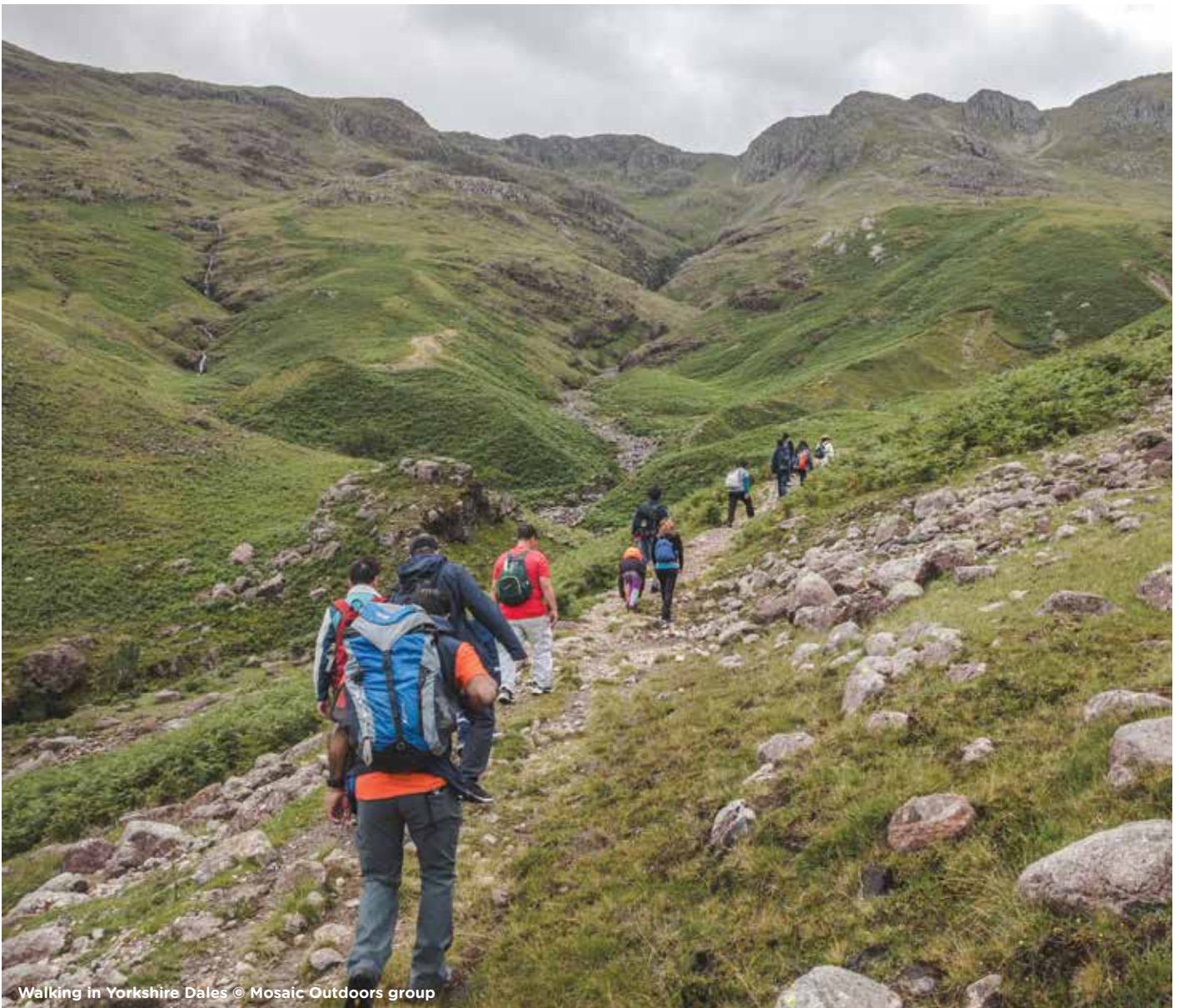
Walking in Yorkshire Dales