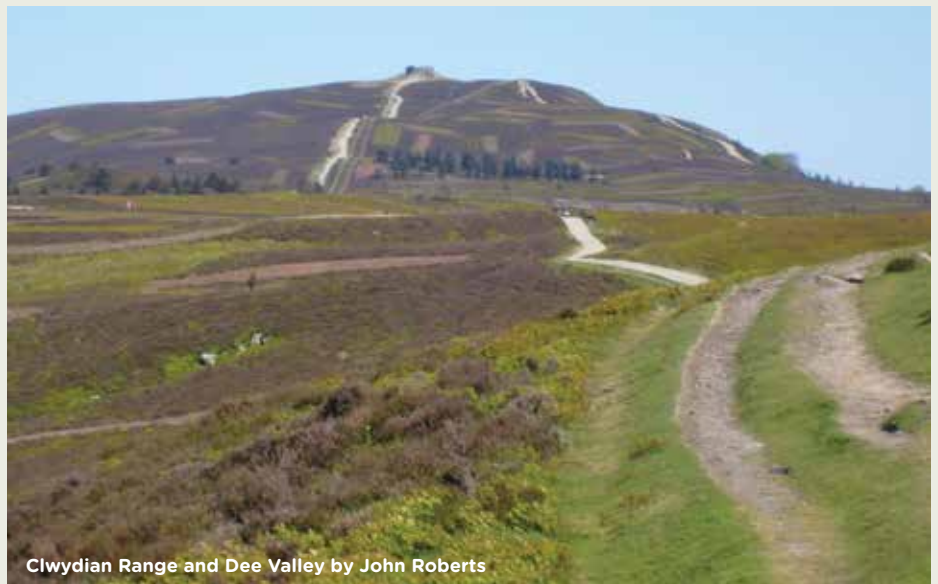
Clwydian Range and Dee Valley

The current AONB team do a marvellous job on limited resources compared to their national park colleagues. With the