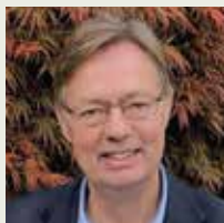
Sir Gary Streeter MP (Chair of the All Party Parliamentary Group for National Parks)